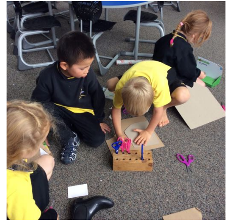
Students built a shelter

Year 2 children learnt about the qualities that make a good leader and what it means to be a good leader. Good leadership is demonstrated through sharing and cooperation in groups, listening to and understanding others' points of view.